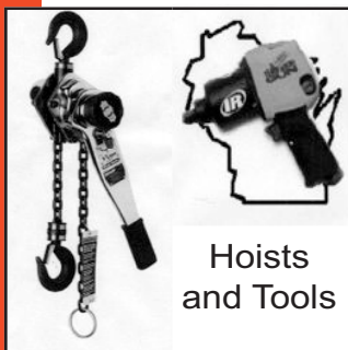
Hoists and Tools