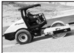
Light Compaction Available with Cabs