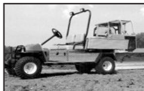
Club Car Utility Vehicles