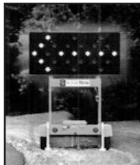
Message and Arrow Boards