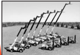
FORKLIFTS- Available with Heat and Defrost

VALUE AND RELIABILITY... POWER YOU CAN COUNT ON