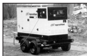
Generators- 3.5 to 500kw